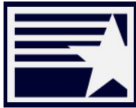
American Pattern CNC Works Cedar Falls, Iowa