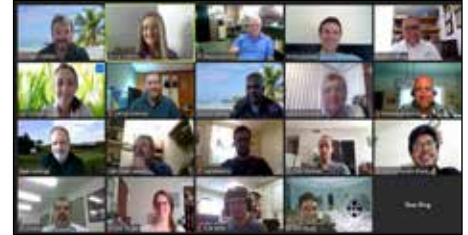
A photo of the July 14-16 Gating & Riser Design 101: Live Online class.

After they register, students get hard-copy materials mailed to them, and they get