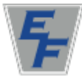
Effort Foundry Inc. Bath, Pennsylvania