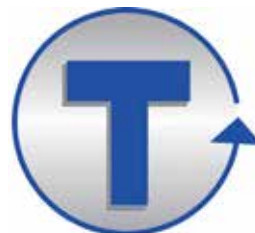
Total Alloy Foundry Inc. Memphis, Texas