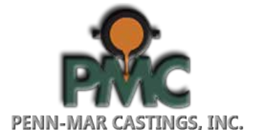
Penn-Mar Castings Inc. Hanover, Pennsylvania