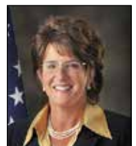
Rep. Jackie Walorski

scientific and technical breakthroughs, and it would boost U.S. metalcasters' ability to innovate and support jobs. As manufacturers work to lead our country's economic recovery during these unprecedented times, we encourage the House to pass H.R. 7766."